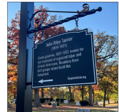
Signs and Markers