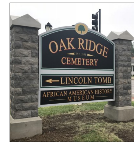
Entrance Sign at N. Grand Ave.