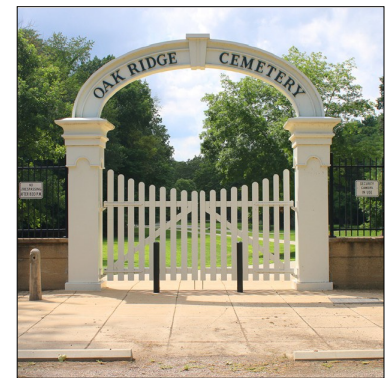
Original Cemetery Entrance Reproduction