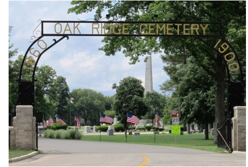
Entrance Gateway at Monument Avenue