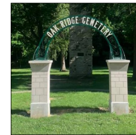
Entrance Arch from circa 1900